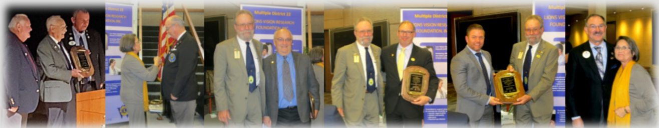
Shown above are recipients of the Arnal Patz Fellowship - those without plaques are progressive Arnal Patz Fellows