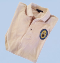
LVRF Polo Shirts