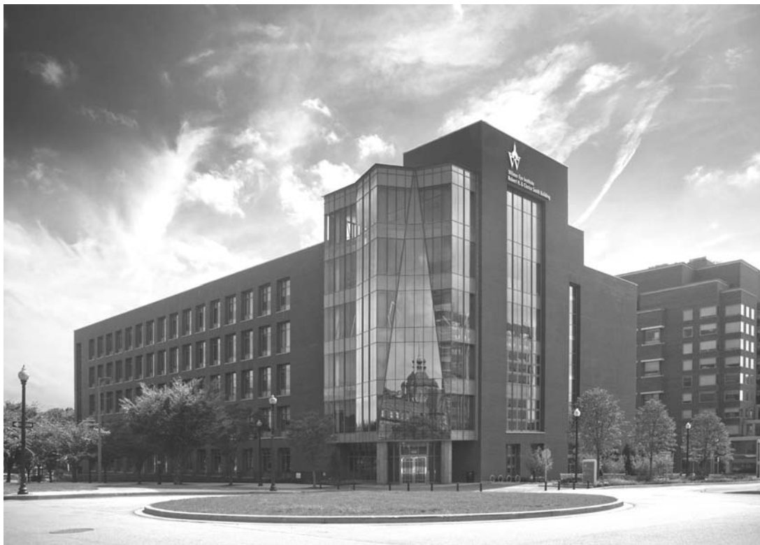
The new Robert H. & Clarice Smith Building of the Wilmer Eye Institute

You may speak to the Wilmer Eye Institute Referral Coordinator any time between 9:00 a.m. and 4:00 p.m. Monday thru Friday. Call 410-955-5080 or 1-800-215-6467 and ask to be switched to the Wilmer Referral Office.