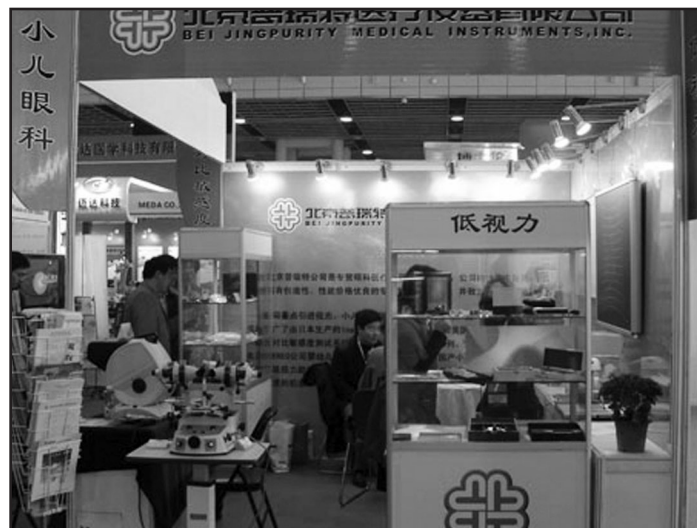
Some of the exhibits displayed at the low vision symposium in Nanjing in April.

3) Marilee Walker, an OT from Sacramento, gave an excellent talk about the approach to eccentric viewing training. She showed examples of how she works with clients and included some information about mobility and devices.